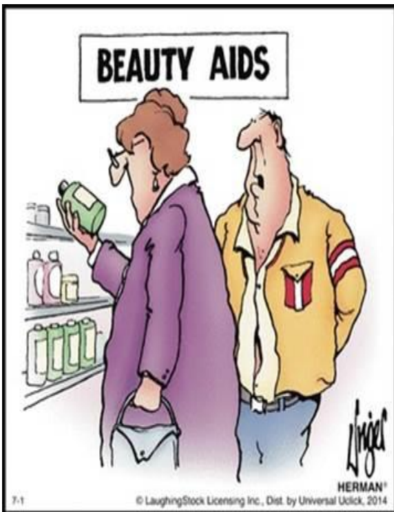
7-1 © LaughingStock Licensing Inc., Dist. by Universal Uclick, 2014 “Want me to get you a shopping cart?”