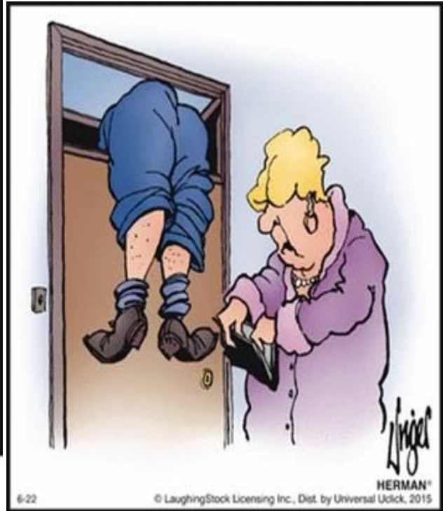
6-22 © LaughingStock Licensing Inc., Dist. by Universal Uclick, 2015 “It’s okay! I found the keys.”