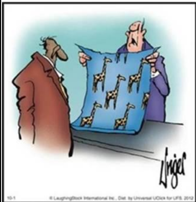
10-1 © LaughingStock International Inc., Dist. by Universal Uclick for UFS, 2012 “I asked my new assistant to get me a sheet of graph paper.”