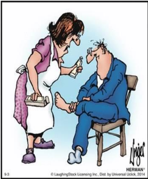
9-3 © LaughingStock Licensing Inc., Dist. by Universal Uclick, 2014 “You getting athlete’s foot is about as ridiculous as a coal miner with sunstroke!”